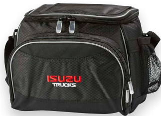
Deluxe Cooler Bag $42.00ea