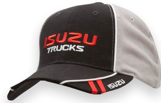
Heavy Brushed Cap $15.00ea