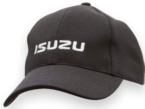
Black Ottoman Cap $12.00ea