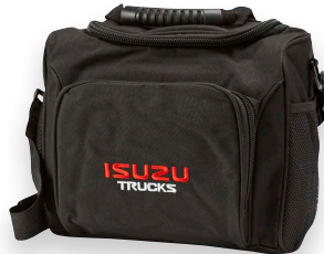
Standard Cooler Bag $34.00ea