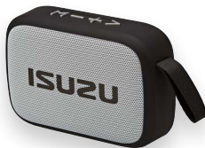
Jive Bluetooth Speaker $23.00ea