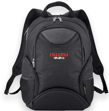
Premium Backpack $100.00ea