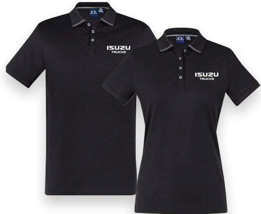
Aston Polos $38.00ea